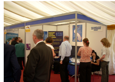
EBN Exhibition Stands

1.13 The keynote speaker, Shadow Technology Minister Charles Hendry, told delegates that securing the conference was a great testimony to KCC's work in the 'Kent Year of Innovation' as one of the most dynamic and successful counties in the country. The event has firmly placed Kent on the international map as a place for SMEs interested in working internationally to do business and relocate. Delegates became aware of Kent's proximity to both London and Continental Europe and the benefits to business that this could bring. The event also marketed Canterbury as a business tourism and international conference venue and EBN was the first large international multi-venue conference the city has hosted. As well as longer term tourism, trade and business opportunities for the city and county, spend by delegates is estimated at £150,000 during their 3-day stay.