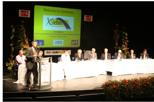
EBN Opening Ceremony

the various levels of government in the EU with small businesses and international partners and driving innovation in the public sector. England had never before hosted this prestigious event nor had EBN featured the transatlantic connection with the United States. Kent's bid to welcome the Congress in 2007 was won against stiff competition from several European capital cities, including Budapest (which hosted it in 2008).