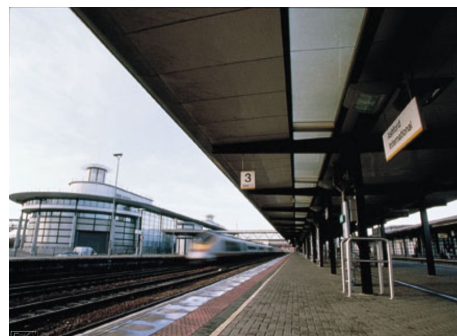
Ashford International Station